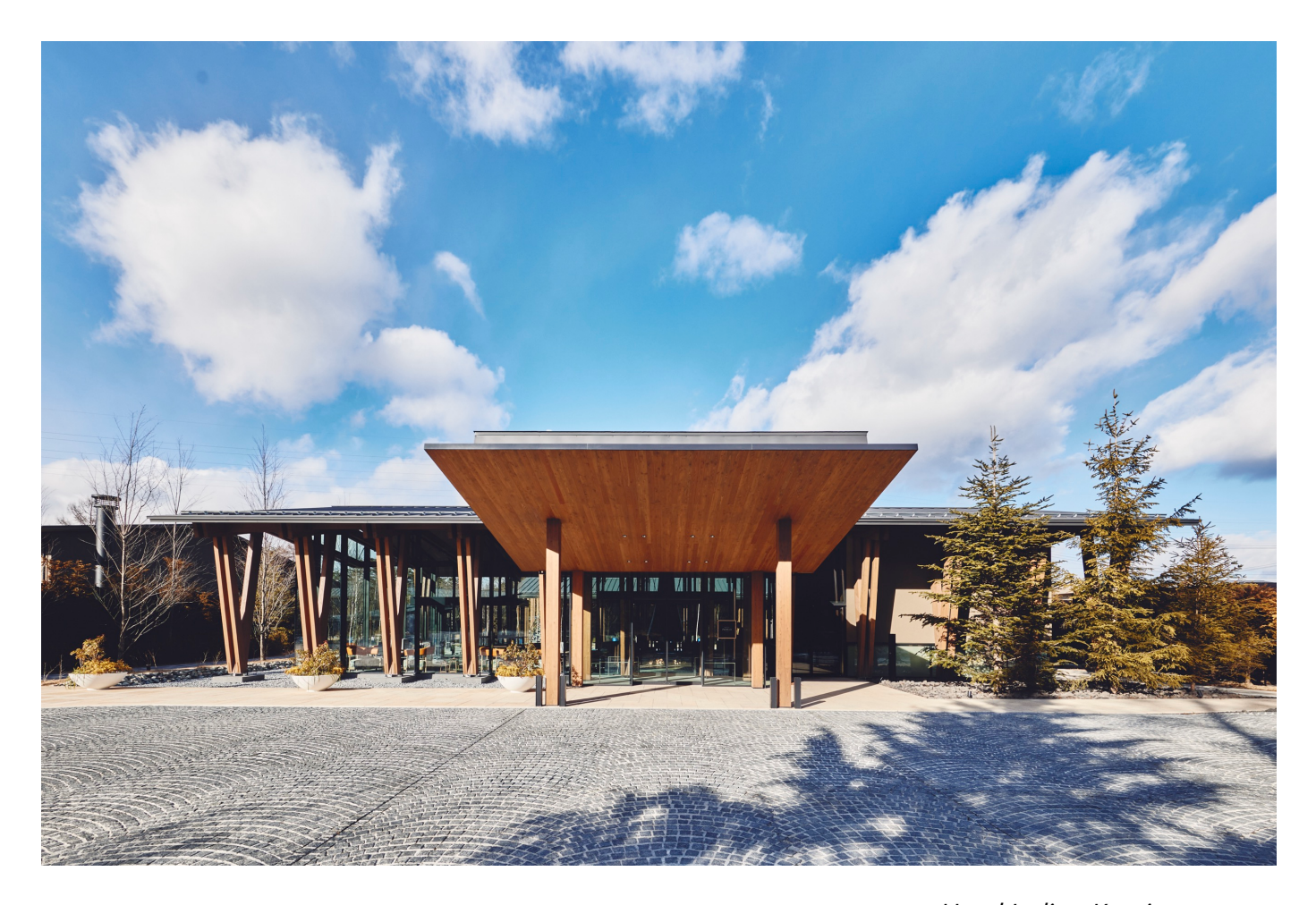
Hotel Indigo Karuizawa

IHG Hotels & Resorts today announces the opening of Hotel Indigo Karuizawa, the region's first globally-branded lifestyle boutique hotel, and the second property in Japan under the Hotel Indigo brand.